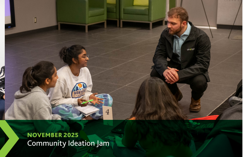
NOVEMBER 2025 Community Ideation Jam