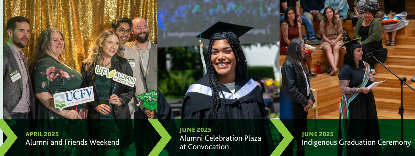
APRIL 2025 Alumni and Friends Weekend