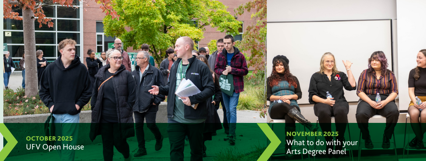
OCTOBER 2025 UFV Open House