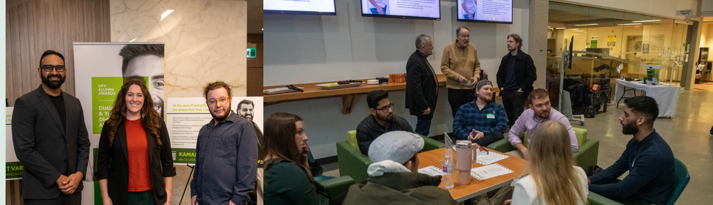
NOVEMBER 2025 Pave Your Own Career Path: Sustainability