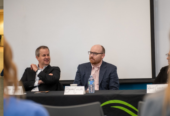
MARCH 2026 College of Arts Showcase Alumni Panel