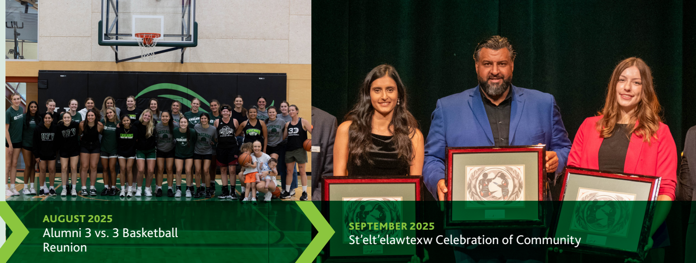
AUGUST 2025 Alumni 3 vs. 3 Basketball Reunion